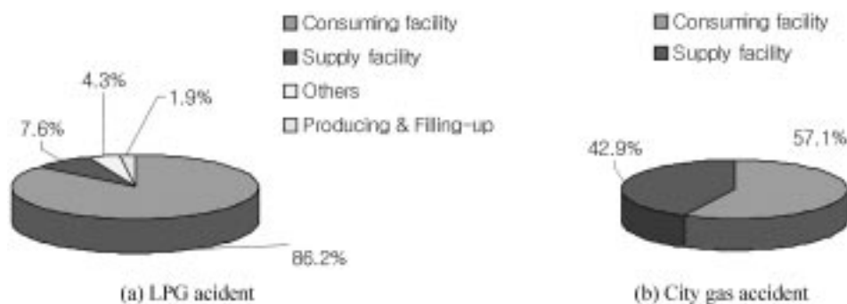
Fig. 2. Gas accidents constitution of LPG and city gas between 1996 and 1999.

As shown in Fig. 2, most of the LPG accidents occurred at consuming facilities such as individual residences, restaurants, and apartments, while most city gas accidents occurred at consuming facilities such as individual residences and apartments, and supply facilities such as piping networks. The number of accidents has decreased from 1996 monotonically as shown in Fig. 3. Although the rate of decrease for city gas was very rapid, that for LPG was rather slow. This may be attributed to the safety level improvement rate of consuming and supply facilities; city gas facilities are far better-equipped with safety devices such as fuse cock valves and multifunction gas meters than LPG ones. As shown in Table 1, a very large decrease was observed for LPG accidents caused by defective installation at individual residences, appliance failures at restaurants, user's carelessness at apartments, and human error at LPG supplying facilities. However, a slight increase was observed for accidents caused