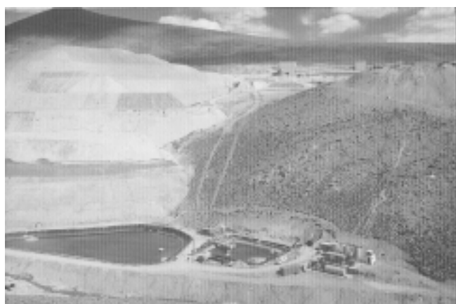
Fig. 1. A large gold leaching operation high in the Andes Mountains at Choquelimpie, Chile. The plastic-lined ponds handle pregnant and barren leach solutions.