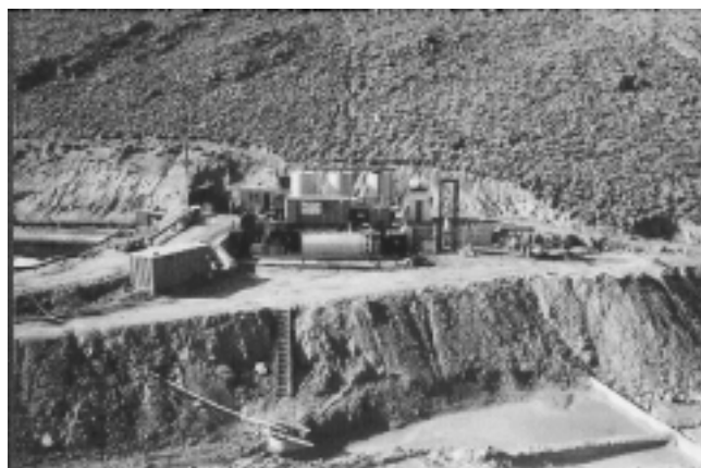
Fig. 3. The compactness of a small modern plant at an old mine site is illustrated.