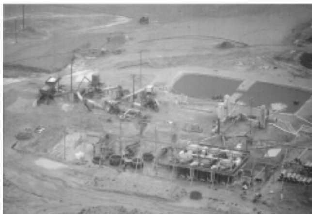
Fig. 6. Erection of the Itos plant, using local labor and engineers. International technology transfer and funding are an integral part of metallurgy today.

the possibility of genetic engineering, this science is rapidly adapting to large-scale metals recovery, especially in gold and copper. Eight biooxidation plants (all in the Southern Hemisphere) have been commissioned to handle gold flotation concentrates. Their capacity ranges between 35 and 1,000 tons per day of concentrate. One gold biooxidation plant has also been commissioned. However, this application is seeing slower growth due to the need to neutralize the acid solution required by the bacteria prior to reaction with alkaline cyanide leach solution.