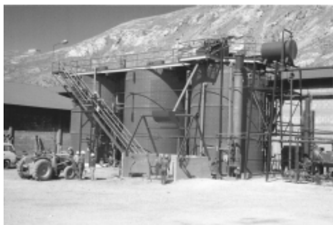
Fig. 4. Heated agitated leaching tanks for iron chloride leaching of silver and lead, Itos, Bolivia. This facility can process treats 15,000 tons of former waste material per month. Plant was erected to treat 1.8 million tons of tin-tungsten tailings containing approximately 400 tons of silver, and large quantities of recoverable antimony, arsenic, lead and copper.

Bioleaching is another growing technology for destruction of gold-encapsulating minerals [e.g. Brierly, 1999]. With the demand for decreasing discharge of chemicals into the environment, and even