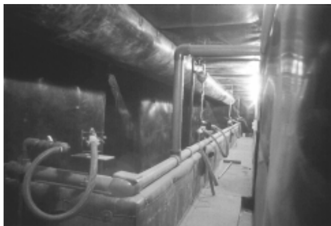
Fig. 5. Interior of Itos plant, Bolivia, showing stainless steel and nonmetallic piping and vessels required to handle hot corrosive leaching solutions. Modern materials make possible handling of fluids that formerly could not be economically contained.