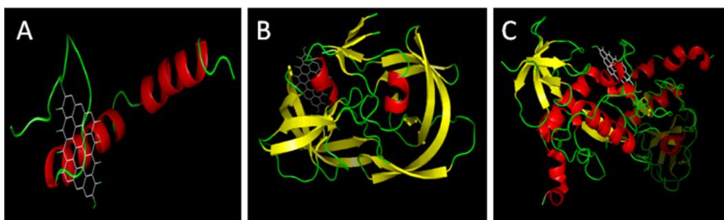
Fig. 2. Molecular interaction of the graphene with the (A) Vpr, (B) Gag and (C) Nef proteins.